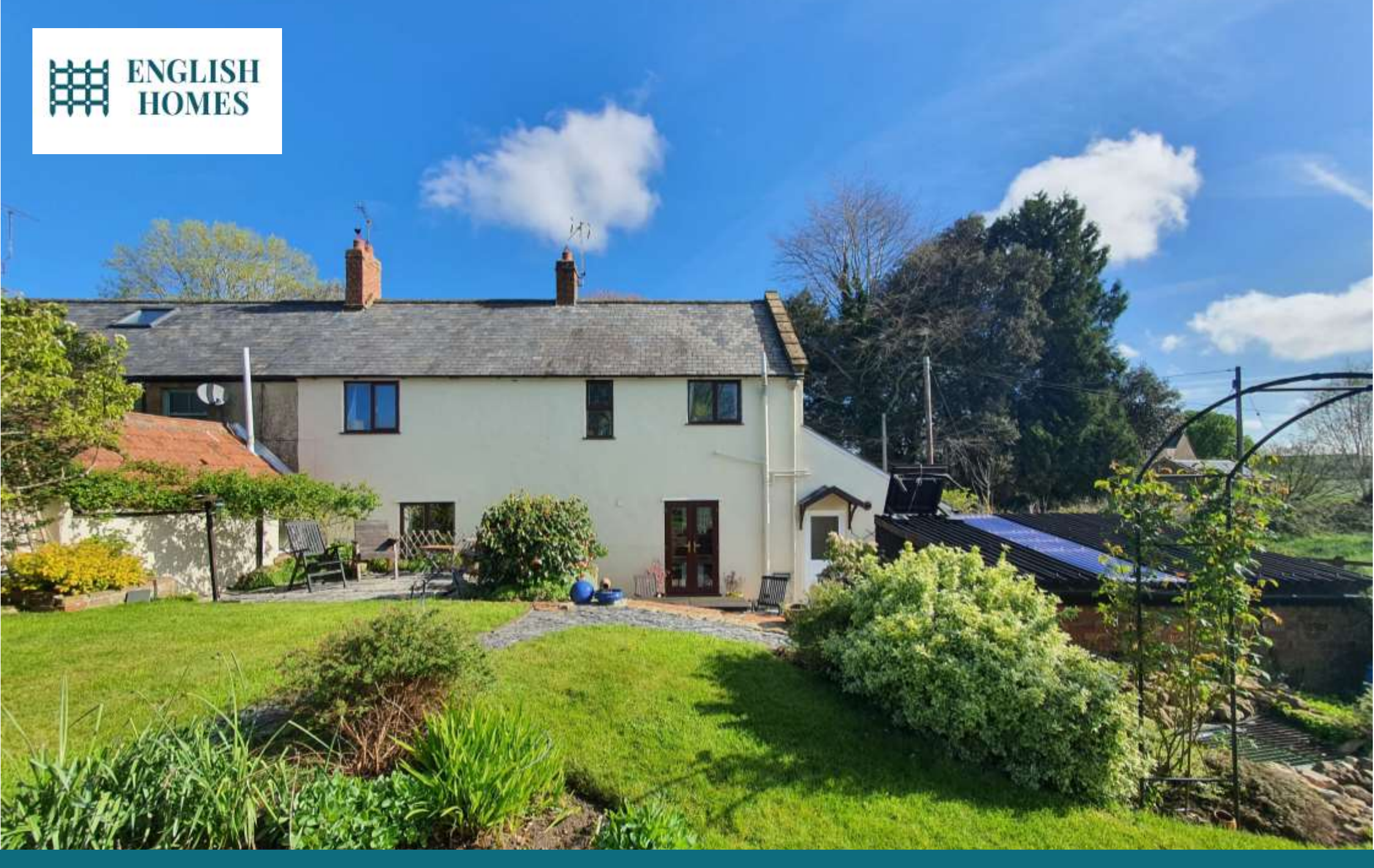
Mill Croft, Tail Mill Lane, Merriott, TA16