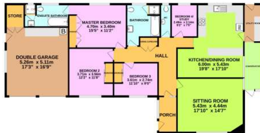
GROUND FLOOR 175.8 sq.m. (1893 sq.ft.) approx.

TOTAL FLOOR AREA: 175.8 sq.m. (1893 sq.ft.) approx. While every attempt has been made to ensure the accuracy of the description contained herein, measurements of areas, volumes, capacity and other facts are given approximately and no responsibility is taken for any error, omission or mis-statement. This plan is for illustrative purposes only and should not be used as such for any purpose other than that intended. The various appliances and apparatus shown have not been tested and no guarantee is given as to their operation or efficiency. See the plan. Please call 01470 422222